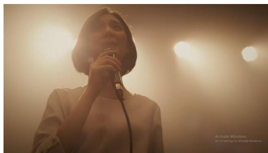
Picture 1 The teacher makes a speech (Source: Miracle in Cell No.7 , 2022)

Teacher : Thank you to Mr. Ustad who has read prayers for all of us, the holy month of Ramadan is a month full of forgiveness, hopefully all of us who are here can get forgiveness from Allah SWT, and now let's watch the performance of the choir from SD Negeri Cilliwung. Let's give it a round of applause.