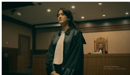
Picture 8 Kartika testifies at trial (Source: Miracle in Cell No.7 , 2022)

The character Kartika also shows a willingness to sacrifice. Kartika, who initially dreamed of becoming a doctor according to her parents' wishes, had to give up her dream. Kartika is willing to become a lawyer to clear the name of her father who has experienced injustice. Apart from that, Kartika also wants to help other people who have the same fate as her father.