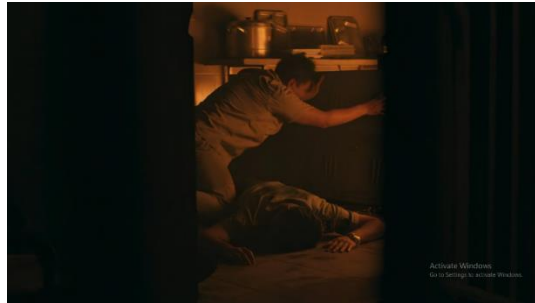
Picture 6 Dodo helps Pak Hendro from a fire

Dodo : Sir Hendro, sir wake up sir, wake up sir, please, help.