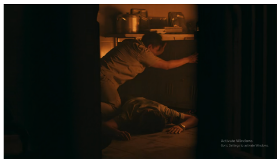
Fig. 6 - Dodo helps pak hendro from a fire.

Hendro : Please, please, please help me, help me Dodo : Sir Hendro, sir wake up sir, wake up sir, please, help.