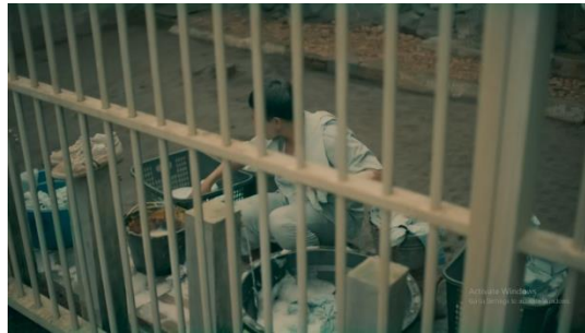
Picture 4 Dodo washing clothes (Source: Miracle in Cell No.7 , 2022)

There is a value of independence in the film Miracle in Cell No.7 by Hanung Bramantyo. The value of independence is shown by the Dodo character. Dodo washed his own clothes while in prison. Even though he is mentally challenged, Dodo does not depend on other people. Dodo always does his own work. This actually teaches us to be independent and responsible with our personal work without bothering other people.