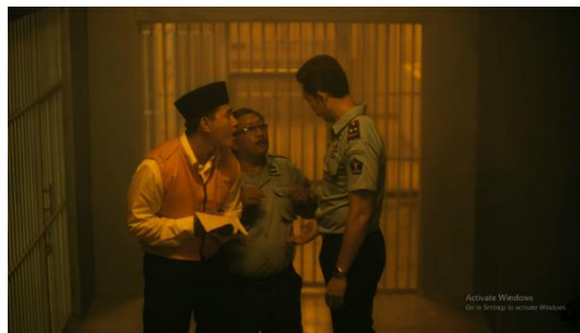
Picture 7 Dodo tells a story to Mr. Hendro (Source: Miracle in Cell No.7 , 2022)

Dodo : Dodo was afraid that at that time he would be forced to confess, they said that if Dodo signed, they would send Dodo home to meet Kartika. So the report is false.