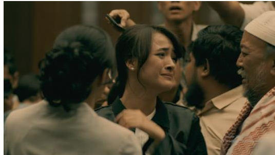
Picture 2 Kartika is grateful after Dodo was declared innocent (Source: Miracle in Cell No.7 , 2022)

Based on research that has been conducted, another moral value related to God is gratitude. Gratitude is a form of expression of thanks to God for all the blessings he has been given. The form of gratitude in the film Miracle in Cell No.7 is shown when Kartika is sad and tense. Tears of disappointment turned into tears of emotion and smiles. This indirect quote shows that the judge's decision which stated that Dodo Rojak was innocent made Kartika grateful and relieved. So that Kartika's tears of sadness turned into tears of happiness.