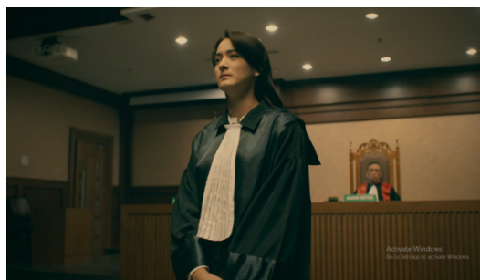
Fig. 8 - Kartika testifies at trial. (Source: Miracle in Cell No.7 , 2022)

Ika : I didn't become a doctor like my father and my mother Juwita's hopes. Because I want to become a lawyer to clear his name. And helping mentally retarded people like my father, who are treated unfairly and abnormally by society