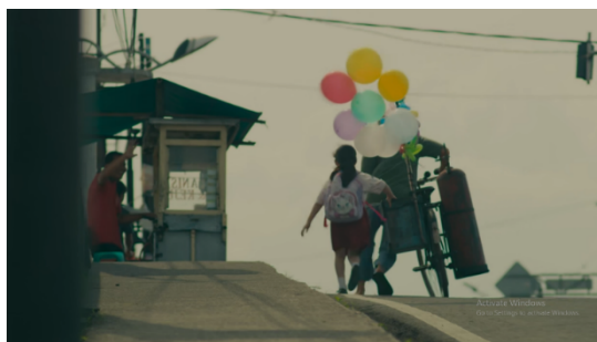
Fig. 5 - Kartika and dodo pushing a bicycle.

Dodo : Ika, help dady Ika : Come on, dady, keep going, dady Dodo : Push, let's push Ika : Go on, dady, come on Dodo : Let's run