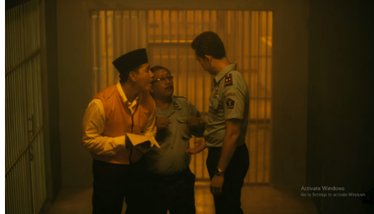
Fig. 7 - Dodo tells a story to mr. hendro.

Dodo : Dodo was afraid that at that time he would be forced to confess, they said that if Dodo signed, they would send Dodo home to meet Kartika. So the report is false.