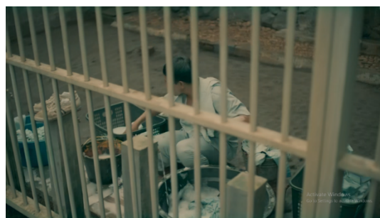
Fig. 4 - Dodo washing clothes.

(Dodo washes clothes) Dodo : White clothes cannot be mixed Gepeng : Hey, don't wash it