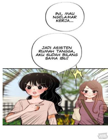
Figure 12 Episode 143: Panel 30

This episode shows Kana helping Melinda get a job.