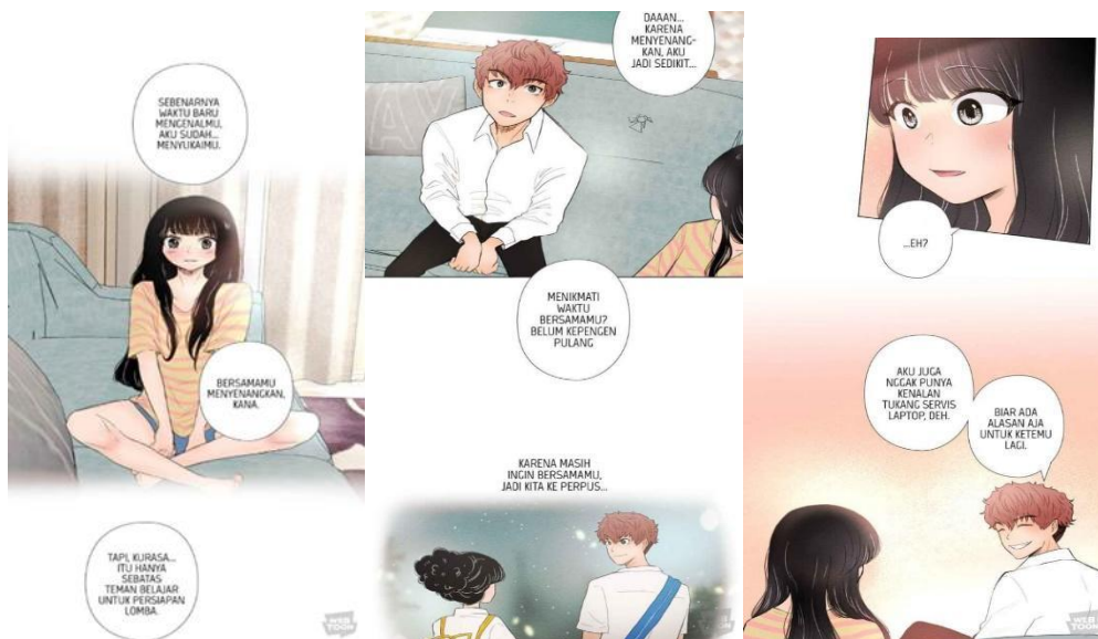
Figure 8 Episode 6: Panels 29-33

This episode shows Kana and Arya sitting on the sofa, Kana asks if Arya has ever liked him.