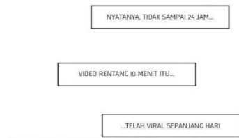
Figure 5 Caption Balloon Shape

(3) Caption balloons are narrative explanations in panels that help readers understand the storyline.