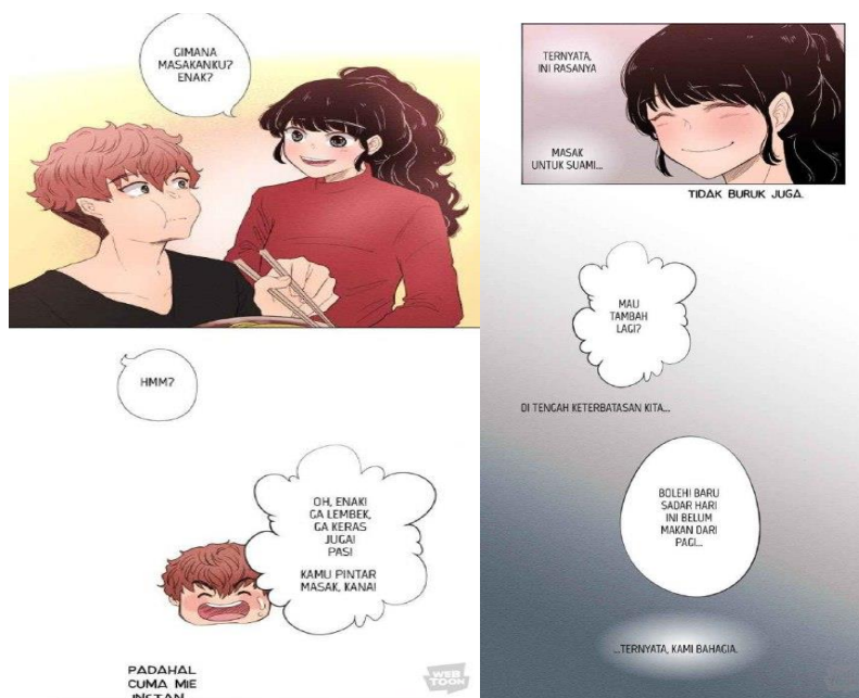
Figure 9 Episode 8: Panels 31-32

This episode shows Kana and Arya just moving into the rented house. Kana cooks instant noodles and they eat together.