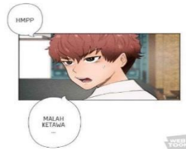
Figure 3 Greeting Balloon Shapes