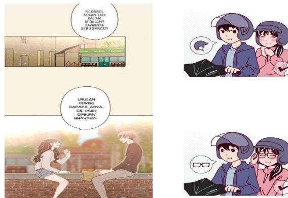
Figure 7 Illustration Forms

Illustrations are images contained in comics. Illustrations are said to be an important element besides text. There are stories in comics that only consist of illustrations without any text because the creator makes illustrations that can represent the content of the story.