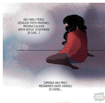
Figure 4 Thought Balloon Shape