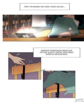
Figure 1 Panel Shape

Panels are boxes that contain illustrations and text that form a story. Panels have various shapes. According to McCloud (in Maharsi 2019: 7) the reading direction of the panel is from top to bottom, left to right, or clockwise.