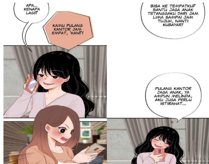
Figure 6 Episode 146: Panels 39-41

This episode shows Melinda calling Kana to help her look after the neighbor's children.