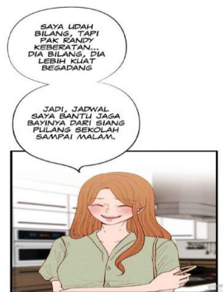
Figure 11 Episode 112: Panel 14