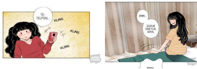
Figure 6 Effect Shapes

Effects in comics are divided into two types, namely first, sound effects which are conveyed through written form. Second, the motion effect, namely a line that has the function of showing movement.